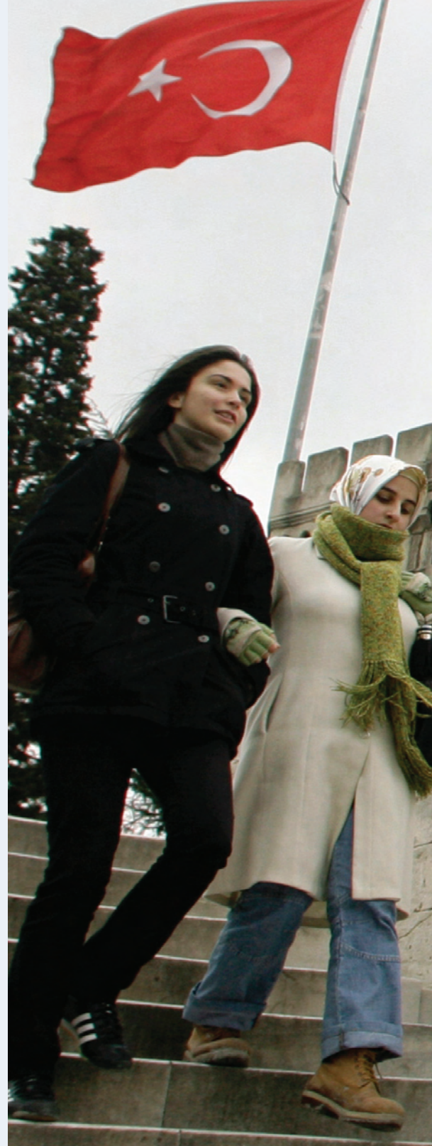
Turkish university students, one of them wearing a head scarf, walk by the main campus of the Istanbul University, in February 2008.

As in many countries around the world, worries about the economy are increasingly dominating internal debates in Turkey. This does not mean that the sensitive questions linked to Turkish identity are erased by these economic difficulties. But in the coming months and perhaps years, core economic issues will require more attention from the Turkish government.