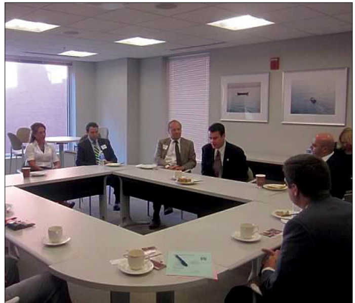
The new TCA headquarters in Washington, DC were formally inaugurated on January 17, 2012 with a lively reception featuring minority community leaders, embassy officials, and members of Congress. The office has already become a central meeting place and second home for many friends and allies.