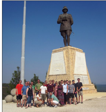
(R) May 2012 Congressional delegation at Bahcesehir University.