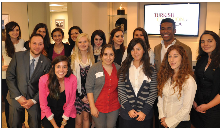
(T) 2012 TCA Advance Scholars come together at TCA for a day of orientation.

In 2011- 2012, the Turkish Studies Project continued to provide fellowships to several graduate students, including its first post-graduate scholar whose master’s thesis focused on the ethnic cleansing and expulsion of Ottoman Muslims from the Balkans.