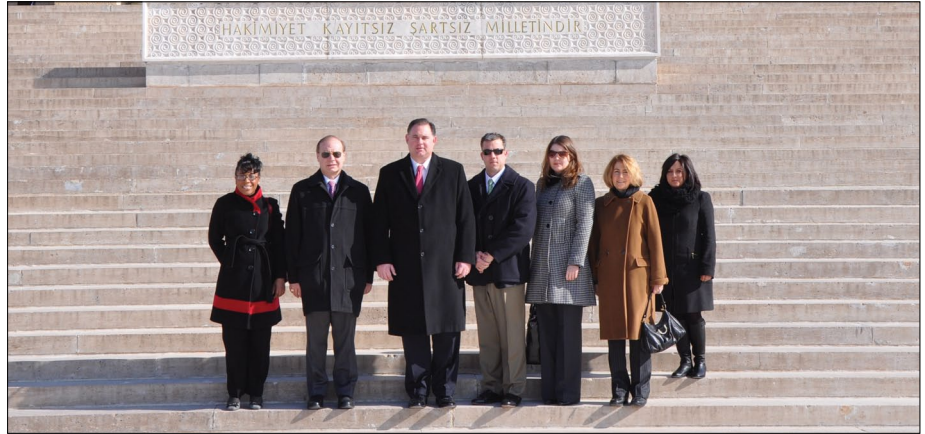
(T) TCA-sponsored February 2012 delegation led by former Congressman Frank Guinta in front of Anitkabir.

TCA has organized and worked with other organizations to sponsor 15 congressional delegations to Turkey, totaling 155 participants.