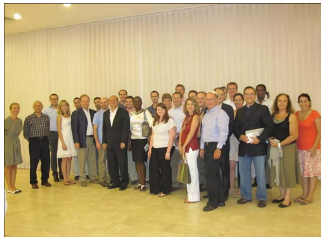
August 2010 Congressional Staff Delegation with Turkish Jewish leaders in Neve Salom Synagogue - Istanbul, Turkey.

In July 2010, TCA sponsored a bi-partisan delegation to Bosnia and Herzegovina and Turkey, consisting of 24 senior staffers . The delegation traveled to Sarajevo and Srebrenica within a day and a half and met with top-level government officials and high-level civil and military international representatives in Bosnia and Herzegovina, including the Chairman of the Presidential Council, the Prime Minister and Ambassadors of the U.S. and Turkey . While in Bosnia, the delegation was joined by 20 participants from Turkey, including journalists, academics, Balkan policy experts, and a member of Turkish Parliament. Acting as gracious hosts and working with TCA to