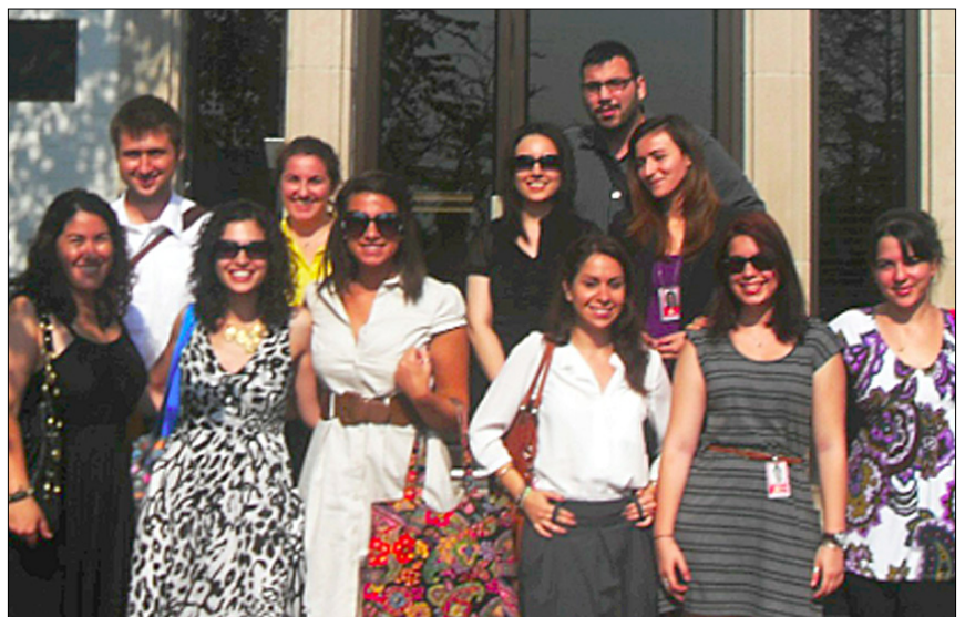
TCA 2010 Washington Summer internship program group in front of the NRCC.

TN), Tom Cole (R-OK), Ed Whitfield (R-KY), Gerry Connolly (D-VA), the Subcommittee on Europe and the Financial Services Committee and at several non-profit organizations. A total of 56 Turkish American students have been given the opportunity to intern in Washington, DC through the Summer Internship Program since 2007.