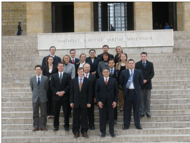
February 2010 Congressional Staff Delegation in front of Anitkabir, Ankara, Turkey.

The first congressional TCA delegation of 2010 was organized in February 2010 when TCA took a bi-partisan delegation of 17 senior staffers to Turkey. The group visited Ankara and Istanbul, meeting with government officials, civil society representatives, academicians and journalists.