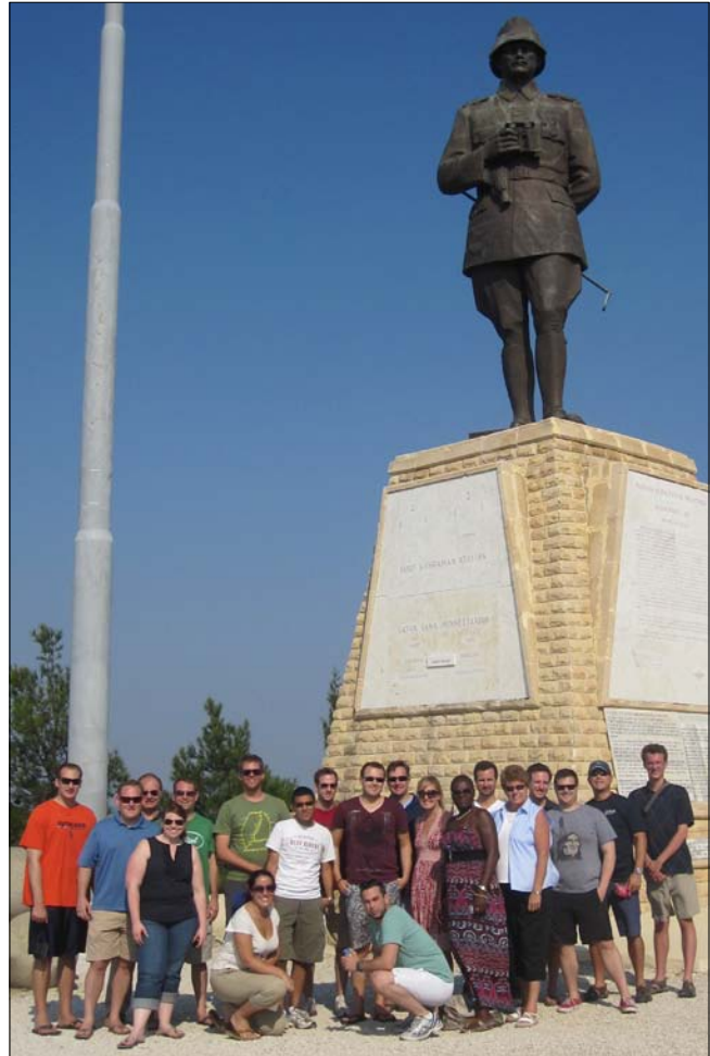
TCA Congressional Delegation at the Atatürk Memorial at Conkbayiri, Gallipoli, Turkey.