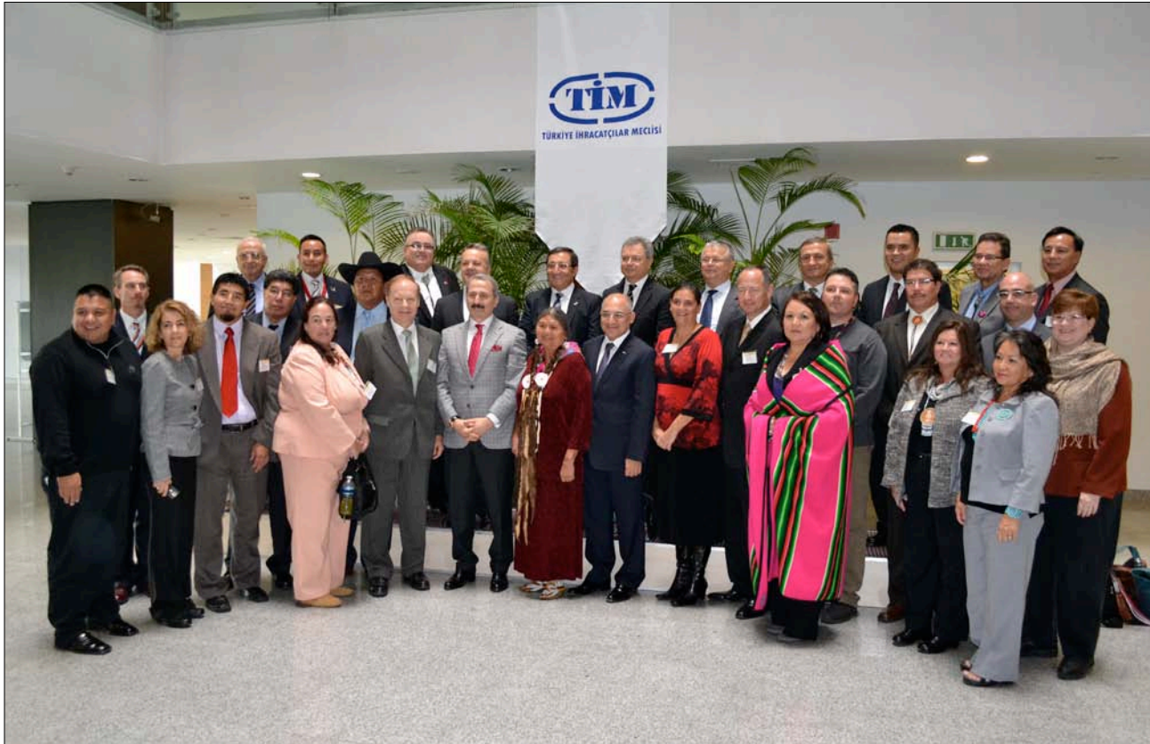
Native American Delegation with Turkish Trade Minister Caglayan, Ankara, Turkey.