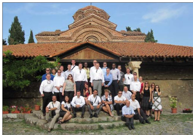
July 2010 Congressional Staff Delegation in front of the Church of St. Kliment in Ohrid, Macedonia.