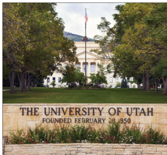
Entrance to the University of Utah in Salt Lake City.