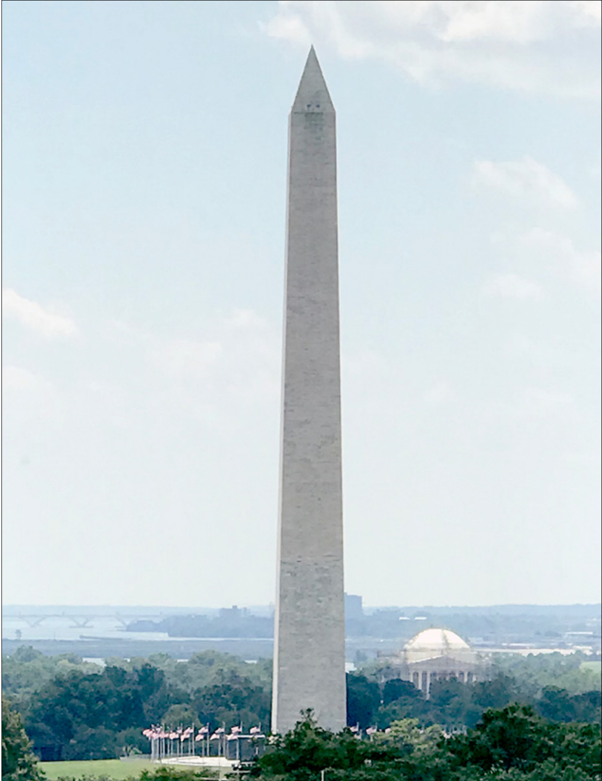
View of Washington Monument from the TCA Washington office.