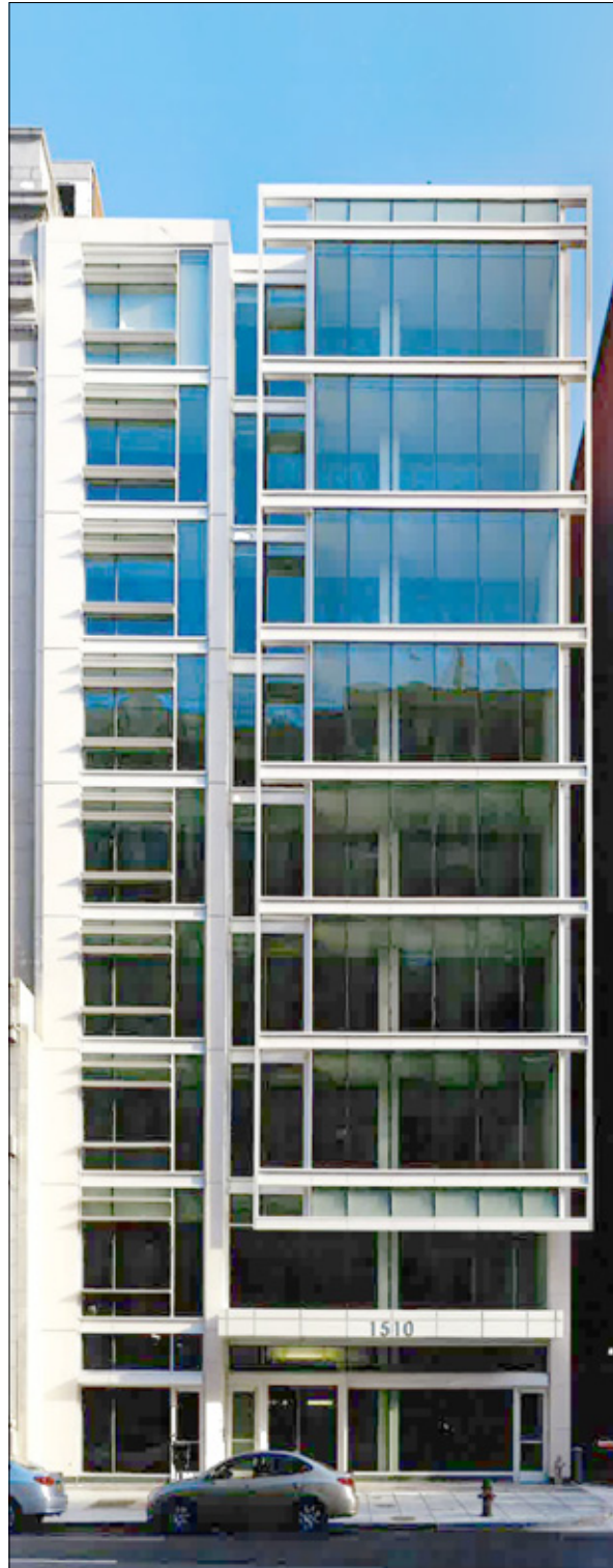
TCA's Washington office at 1510 H Street, NW, near the White House and Lafayette Park.