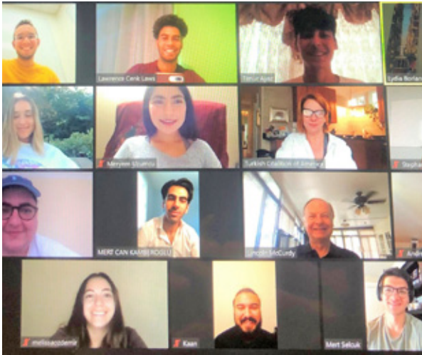
Closing ceremony via Zoom for TCA's 2020 summer interns