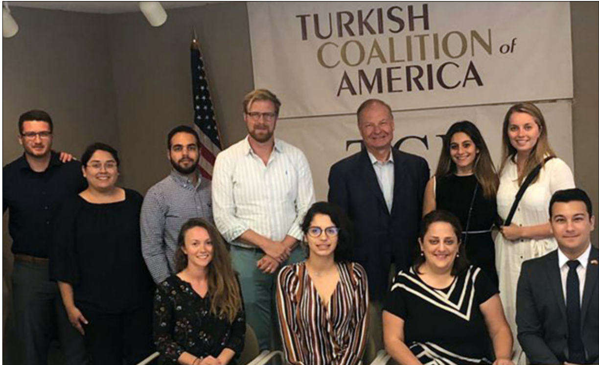
TCA hosted a delegation of American students from the University of California, Irvine (UCI).