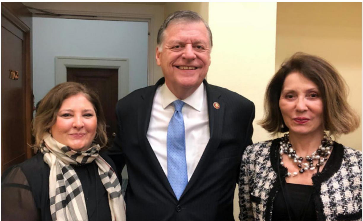
Participants of the TCA Turkish American Women's Leadership Initiative reception on Capitol Hill with Congressman Tom Cole (R-OK/4th).