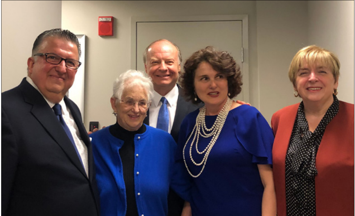
Congresswoman Virginia Foxx (R-NC/5th) with the participants of the TCA Turkish American Women's Leadership Initiative in the U.S. Capitol.