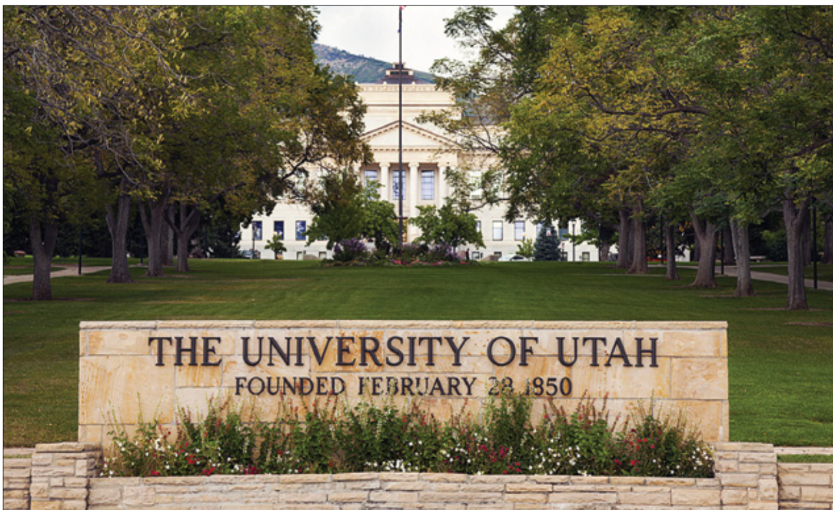
Entrance to the University of Utah in Salt Lake City.