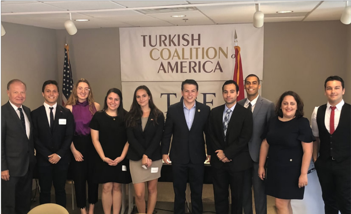
2019 TCA Washington Summer interns with Congressman Brendan Boyle (D-PA/2nd) (center)