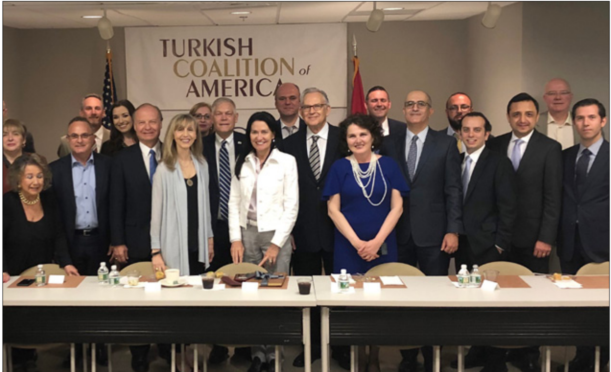
TCA hosted a dinner reception to honor former Congressman Pete Sessions (R-TX/32nd).