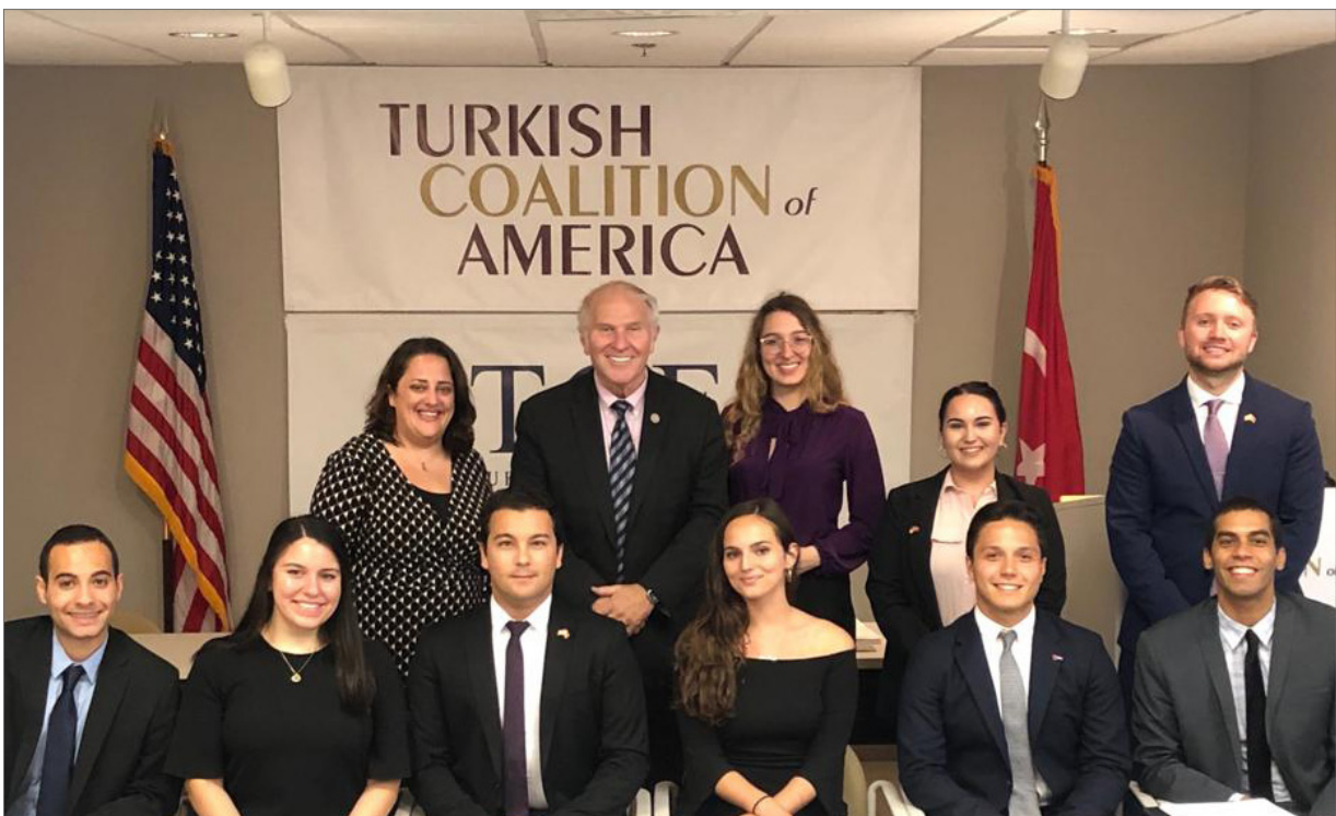
2019 TCA Washington Summer interns with Congressman Steve Chabot (R-OH/1st)