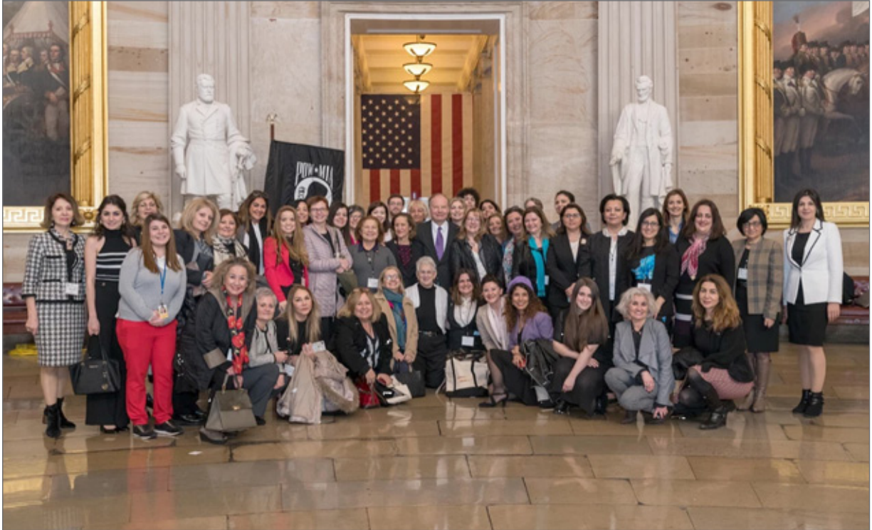
U.S. Capitol Rotunda photo – Congresswoman Virginia Foxx add (R-VA/5th).