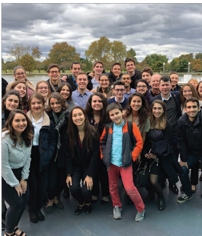
Delegates saying farewell on the boat.