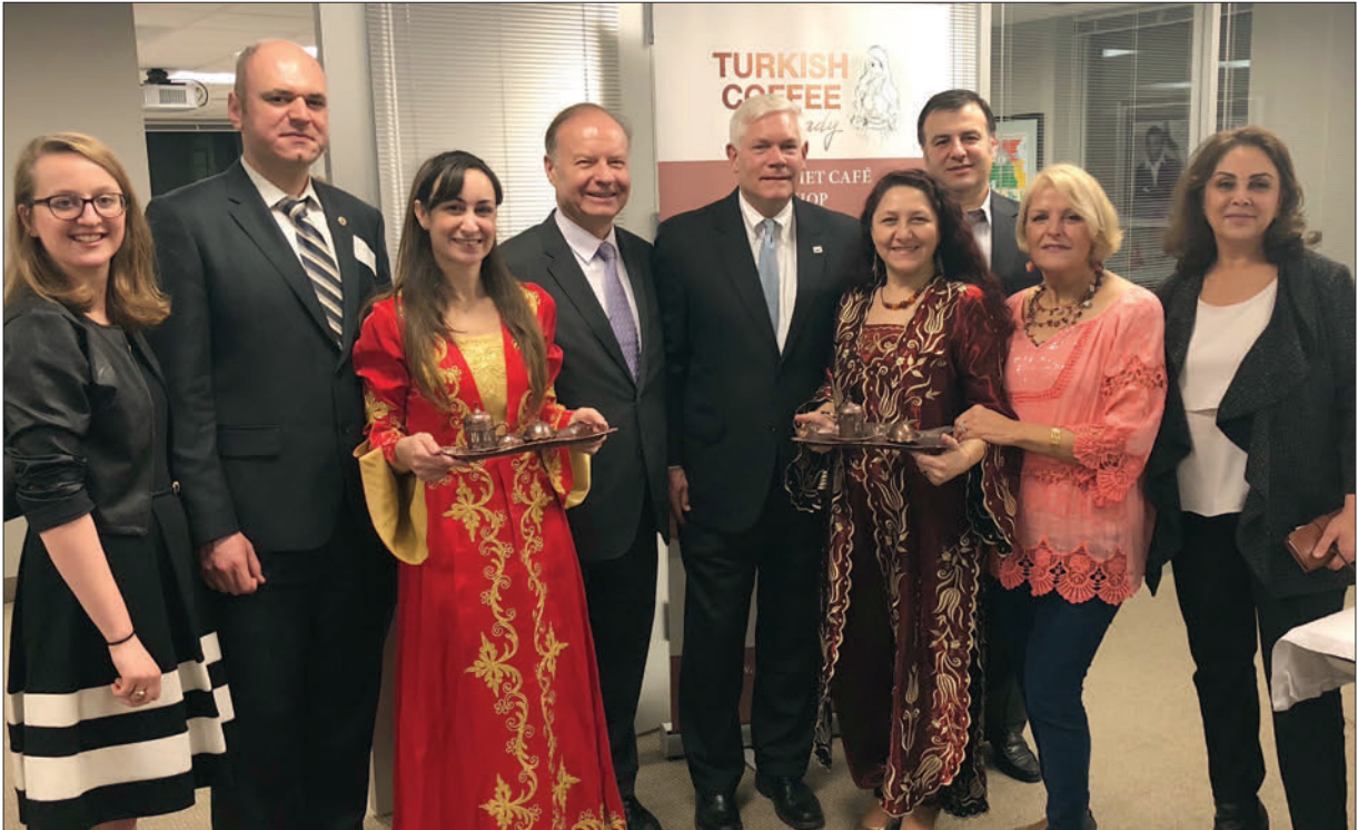
Congressman Pete Sessions at TCA Headquarters.