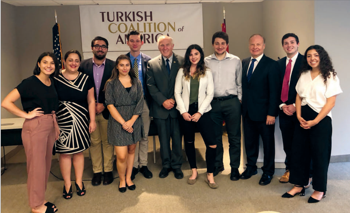
2018 TCA Washington Summer interns with Congressman Steve Chabot (R-OH/1st), a Co-Chair of the Congressional Caucus on the U.S.-Turkey Relations and Turkish Americans.

“ My internship at the Middle East Institute this summer has been an invaluable experience for my professional development as I’ve written reports and summaries on various aspects of Turkish politics. I made many important career connections.