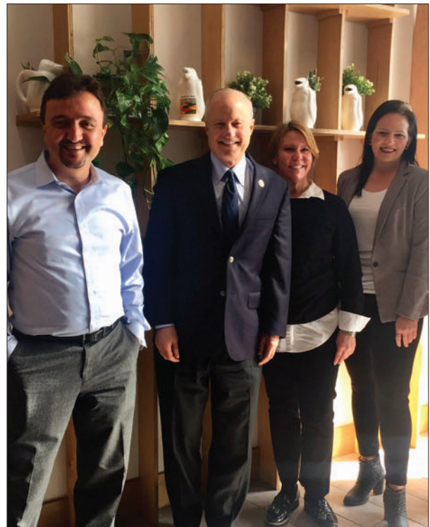
Congressman Coffman with the Turkish American Community in Denver, Colorado.