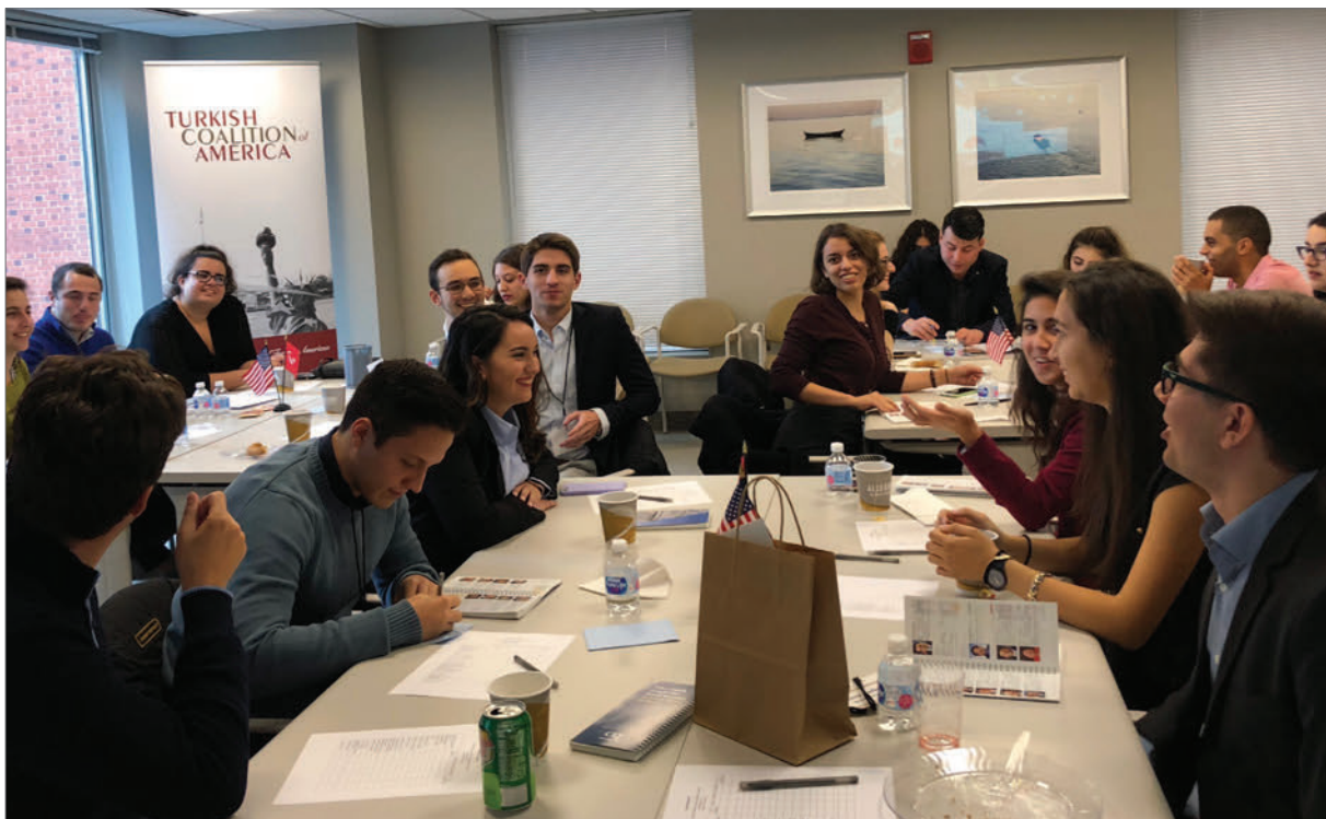
The delegates participate in a competition to test their knowledge of their own Congressmen in an intense battle.