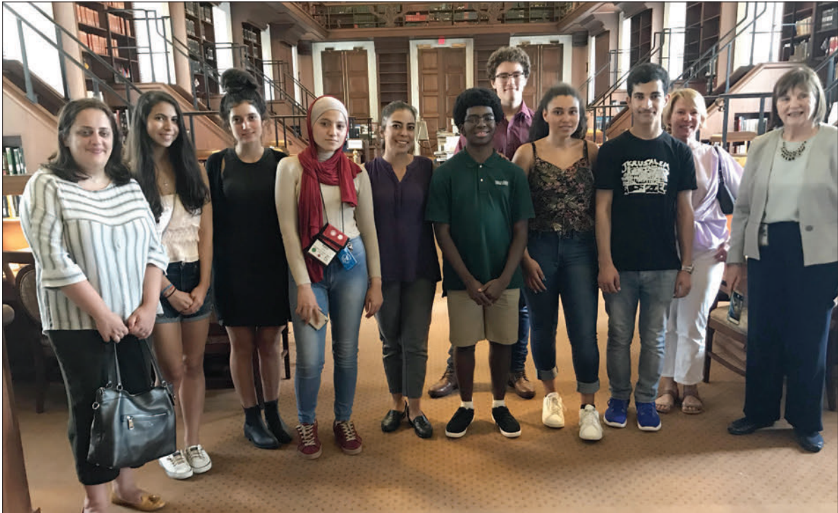
Young Cultural Ambassadors Visit Library of Congress.