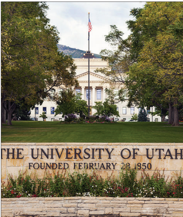
Entrance to the University of Utah in Salt Lake City.