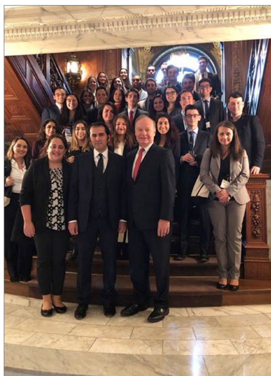
The delegates at the Turkish Ambassador's residence.