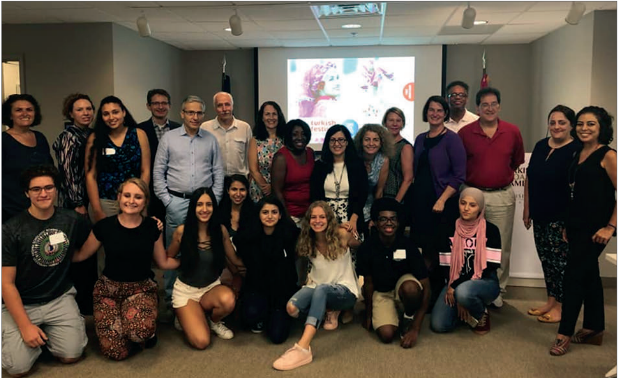
TCA's 2018 ATA-DC Young Cultural Ambassadors.