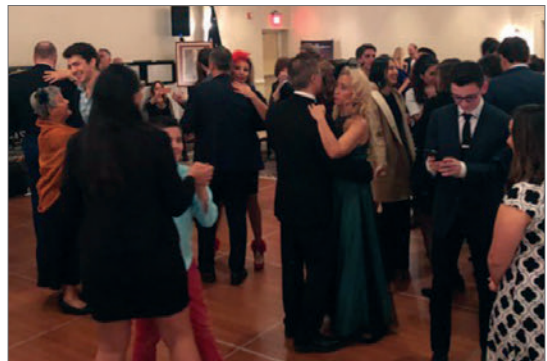
Youth Congress delegates at the ATA-DC Republic Day Gala.